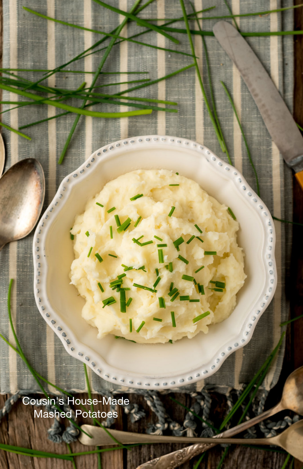
Cousin's House-Made Mashed Potatoes